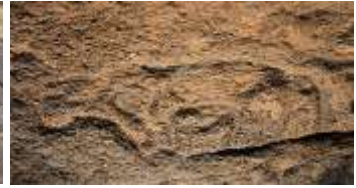
BULLS, as sun gods, are lined up the very top section along northern edge of the rocky bed. (Sunset) (Sunrise from the East)