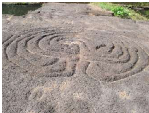
The Labyrinth at the very center (likely a coiled snake), nature's driving force