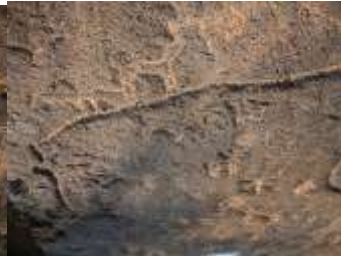
Animal world (only a few are shown of the many that helped and sustained them)