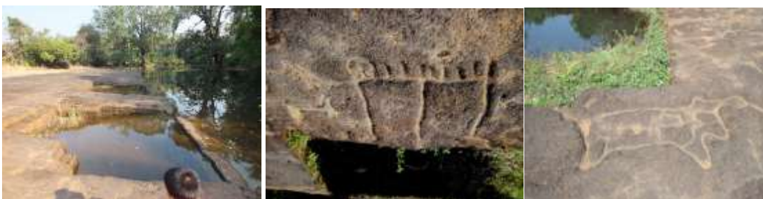
The underworld represented by the Kushavati River and the carved pools of water.

In order to understand their visible world, humans everywhere have attempted to model their vision of the space surrounding them. It appears that from the location, the layout of the site and the many carvings on a rocky bed at the bend of the river at Usgalimal, may have served as their model of the cosmos.