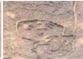
The new farmer and his tools (An iconic figure seen from different angles)