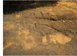
The peacock is the carrier of souls to heavens.