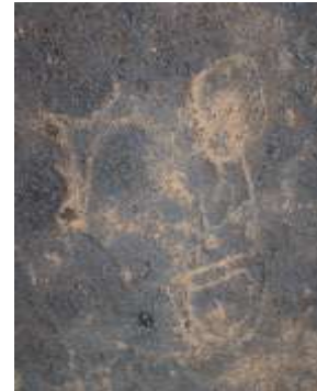
Human activities under the starry skies