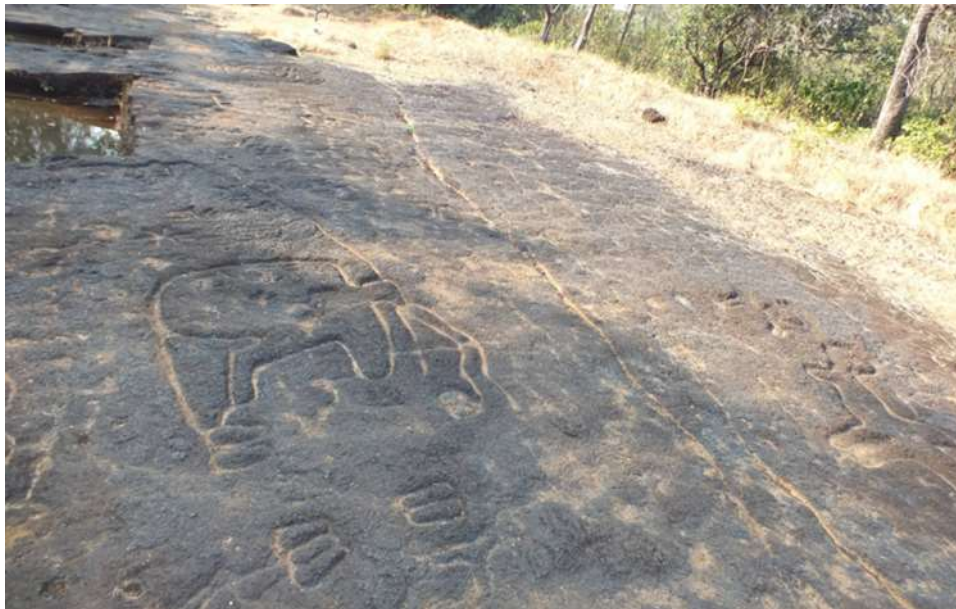
At the top along the grassy area is the SKY; in middle section, EARTH; and the river, the NETHERWORLD.