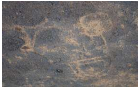
Fig. 28. Drum-beats to accompany the dance

The life-sized human figures of the dancer-story teller are located at the easternmost end of the site. In fig. 26, since the left leg is more muscular and half covered than the right it appears that the individual is androgynous - Ardhanarishvara - half man and half woman. As it also holds torches in both hands, the event appears to be at night.