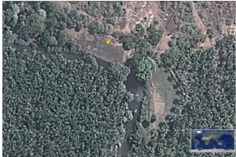
Fig.2 Satellite photo of site on the bank Kushavati River

The corpus of carved images include snakes, bulls, dogs, goats and deer, peacocks, an eagle, fishes, earth mother, dancing humans, anthropomorphic and other unidentifiable entoptic or masked figures, and geographical and time markers. The human figures are concentrated on the eastern side.