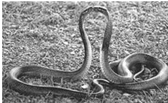
Fig. 21 Picture in real life

The exotic carving of rarely observed snake pairing fig. 20 is a testimony of the artists’ intimate knowledge of the animal behavior and their environment.