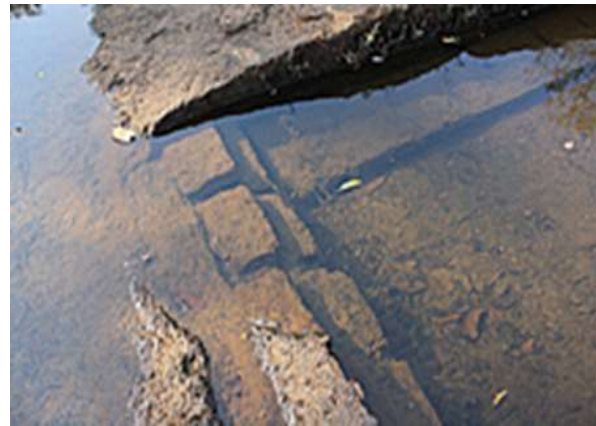
Fig.3a. A corner of the pool showing the carved steps