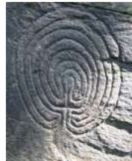
Fig.19 Labyrinth at Cornwall, U.K.

After studying several models to decipher the carving at Usgalimal, the one that fits very closely is of a tightly-coiled python or a serpent with cup holes in the center and four creases or wrinkles at the folds, as seen in fig. 17. These “openings” at the folds could not be discerned readily, and, were most likely carved out so that the vivifying rain water or the sacrificial blood would flow freely throughout the labyrinth.