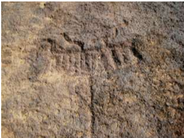
Fig. 22 Snakes on top of staff

The exotic carving of rarely observed snake pairing fig. 20 is a testimony of the artists’ intimate knowledge of the animal behavior and their environment.