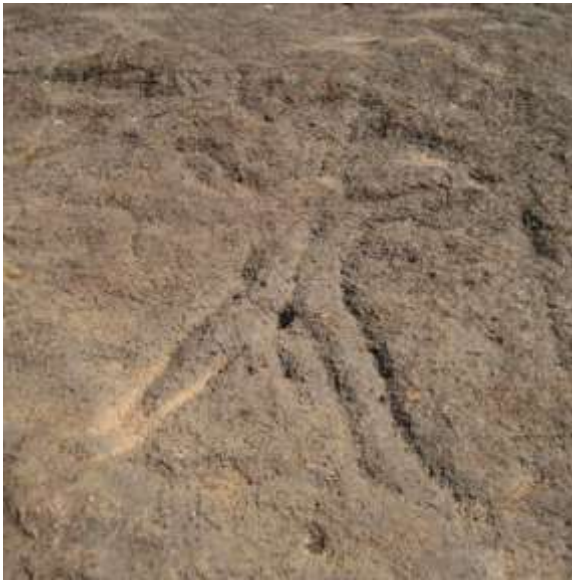
Fig.24 Earth Mother form Usgalimal with prominent vulva and compound heads of an animal and a snake or eagle.

The image of Earth Mother or Mother Goddess, carved on a large laterite rock bed of the Selaulim River bank in Curdi, in Sanguem taluka - not far from Usgalimal - is estimated to have existed for at least 2500 years. In 1988, before the tributary of Zuari River at Selaulim was dammed, the Directorate of Archives and