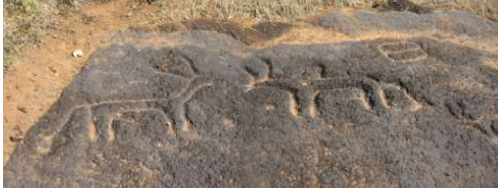
Fig. 31 Stylized bulls of different species at the extreme north-west end