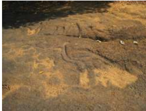
Fig. 13 A Peacock