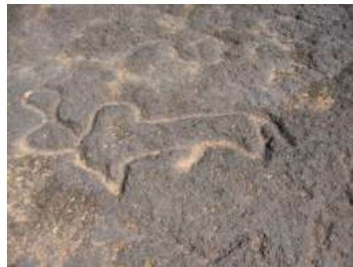
Figs. 34 and 35 Bulls with horns pointed inwards to almost a circle

Unlike the many humped and other types of bulls, with prominent phalluses, there is not one easily recognizable female species among the bovines or caprids.