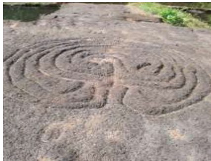
Fig.18 Labyrinth at Usgalimal-Goa