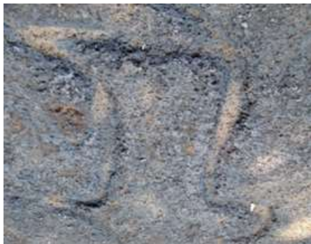
Fig. 20 Carving at Usgalimal

According to B.H. Baden-Powel...“there was an ancient serpent (and sun) worshipping race in Kashmir; that the people of Taxila, in Alexander’s time, were snake worshippers. 7 Presently, in the Kashmir Valley and the Kangra Valley in Himachal Pradesh, there are several shrines in the vicinity of the springs dedicated to the snake gods, Shesha Naga, Vasuki, Karkotka and more. In Kashmir, the word for spring is also naga , who are considered to be the earliest inhabitants of that region. According to the local legend, King Lalitaditya is believed to have been born of a serpent Naga. 8