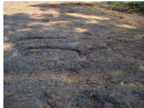
Figs. 32 and 33 Other petroglyphs of stylized bulls