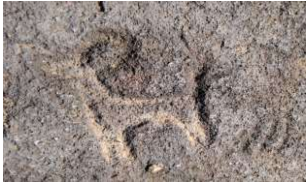
Fig. 6 Deer