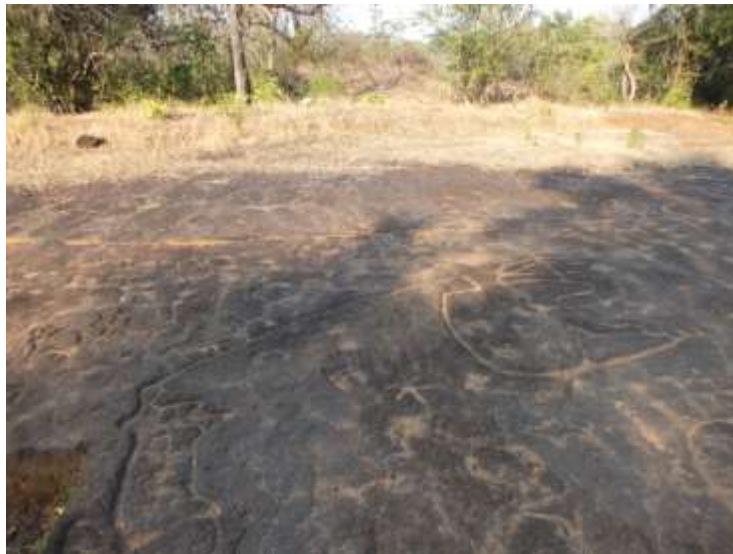
Fig. 38 The headless bull linked to the large iconic petroglyph at right

The petroglyphs shown above, present in great details very realistic images of the sacrificial bulls. There is also a channel or link connecting the headless animal near the pool fig.38 connected to the anthropomorphic one I fig. 30 (see figs.29 and 30).