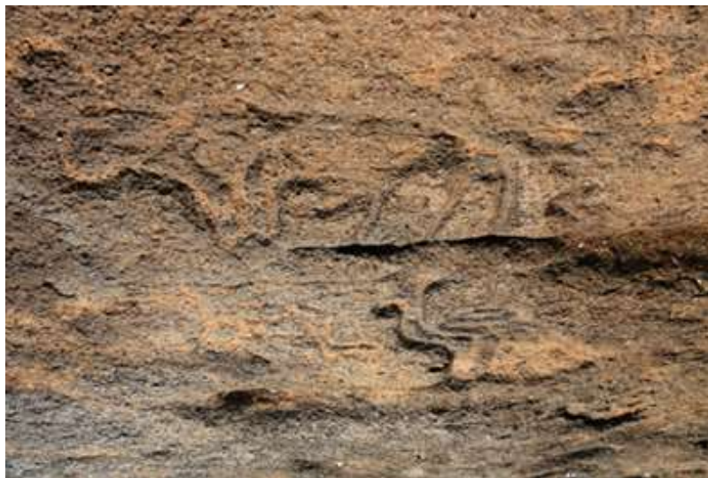
Fig. 14 A hybrid bull-bird carving