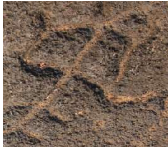
Fig. 23 Flying snake? Enlarged from fig. 11