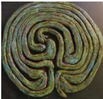
Fig. 17 Model of the labyrinth

Unlike a maze, with many dividing paths and dead ends frustrating the objective of reaching the center or the goal, the labyrinth at Usgalimal is a meandering one, with undivided continuous circular path - unicursal maze - leading to the center and back.