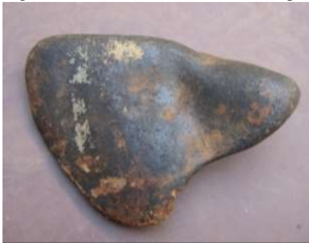
Fig.16. Polished stone axe found at the Usgalimal (now housed at Pilar Museum, Goa)

The invention of the axe, that started the “Farming Revolution” of the Stone Age, has been considered to be as important as the wheel and the steam engine of the Industrial Age. This simple human invention made it possible for the nomadic tribes to transition to the Neolithic Age – to become the first farmers. The axe transformed the landscape from forests to agricultural farms. The abundance of food supply produced locally led to permanent settlements, larger families and structured societies.