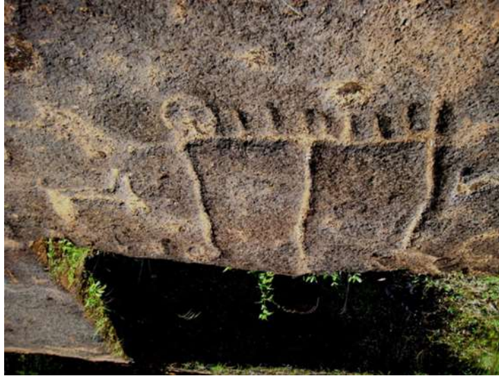
Fig. 15 Giant feet and some animals acting as guards/attendants on either side. (Note the last two digits of the left foot appear as heads.)