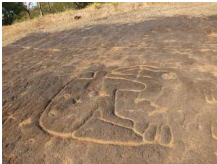
Fig.4 A view from the river facing north