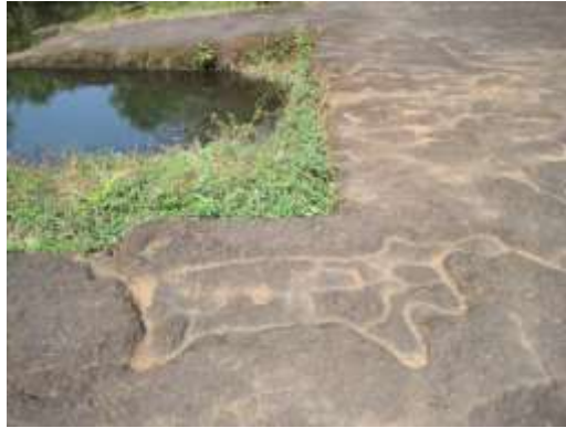
Fig.37 A headless bull

The petroglyphs shown above, present in great details very realistic images of the sacrificial bulls. There is also a channel or link connecting the headless animal near the pool fig.38 connected to the anthropomorphic one I fig. 30 (see figs.29 and 30).