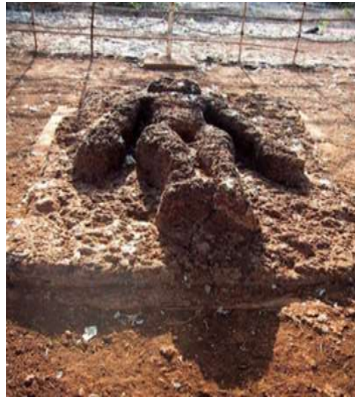
Fig.25 Earth Mother from Curdi now in Verna

Archaeology, concerned that the prehistoric treasure would be submerged by the newly-created reservoir, decided to salvage from its watery grave and relocate the iconic megalith to Verna. 9,10