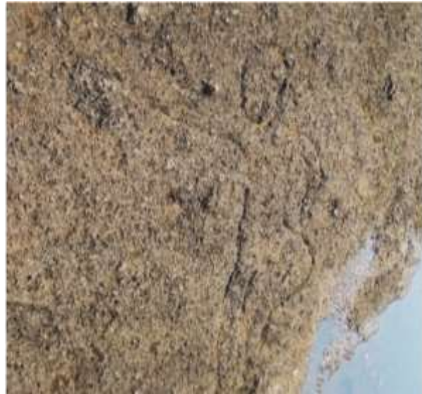
Fig. 27 A dancer

The life-sized human figures of the dancer-story teller are located at the easternmost end of the site. In fig. 26, since the left leg is more muscular and half covered than the right it appears that the individual is androgynous - Ardhanarishvara - half man and half woman. As it also holds torches in both hands, the event appears to be at night.