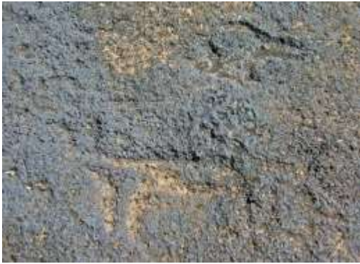
Fig. 12 A Griffin-like animal-bird hybrid?

Most of the animals depicted appear to be males, from their prominent phallusus, and, are either facing in one direction or at each other.