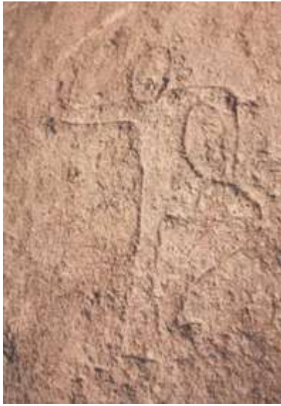
Fig. 26 Dancer - Lord who is half woman or a shaman representing both sexes.