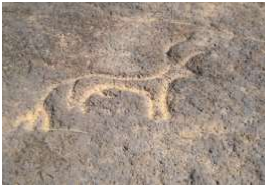
Fig. 5 Bushy tail deer