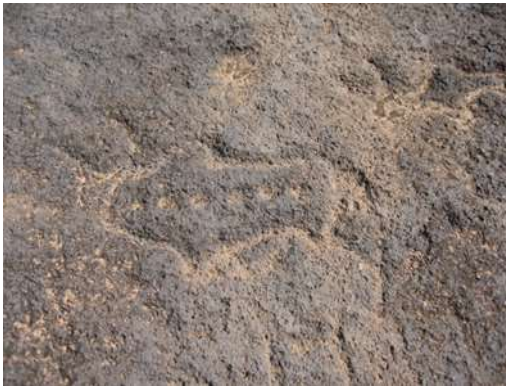
Fig.36 A bull with a collar around the neck

Evidence of bull worship has been found in almost every part of the ancient world - in Çatal Huyuk, Anatolia (modern Turkey), as early as c.7000BC and Crete in c.2000BC. Images of bull sacrifice have also been found engraved on Sumerian porphyry cylinder seals c. 2300BC. It is also documented in the cuneiform tablets, the epic poem of Gilgamesh, that ...”they butchered and bled the bull and then cut out its heart to offer as sacrifice before Shamash (ancient Mesopotamian sun-god).”