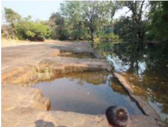
Fig.3 View from west of pools of water and the river

apparent that the carved steps seen in Fig.3a would have been used by the worshippers to descend into the pools.