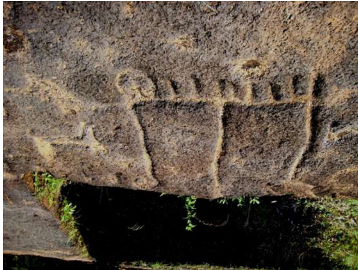
Fig. 15 Giant feet and some animals acting as guards/attendants on either side. (Note the last two digits of the left foot appear as heads.)