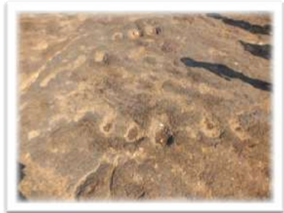
Fig. 30 A possible Sundial

The above carvings indicate that the early settlers of this land were familiar with the directional concept of space, both from their observations of the movements of heavenly bodies, the sun and moon, and particularly, the fixed North Star (Polaris) that was easily visible every night from the petroglyphic site on the bank of the river.